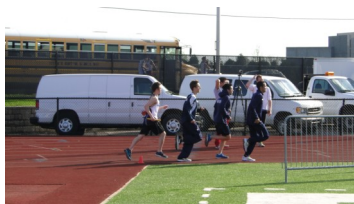
The Varsity 4x800 relay team warming up

For complete results and more pictures check out the team website www.lphstrack.com