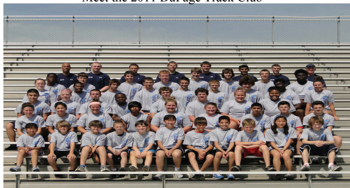
Meet the 2011 DuPage Track Club