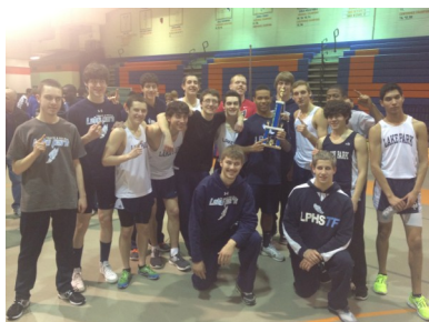
Team Trophy Celebration